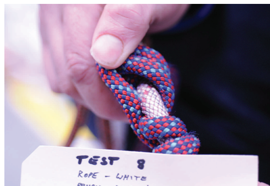
FROM TOP: GLAZING: THE DISCOLOURATION FROM THE GLAZED PRUSSIKS CAN CLEARLY BE SEEN ON THE WHITE PARENT ROPE MEASURING: THE DISTANCE THE PRUSSIKS TOOK TO ARREST THE LOAD IS MEASURED FROM THE START POINT (MARKED) MELTED: THE PRUSSIKS ARE WELDED TO THE PARENT ROPE POST DROP